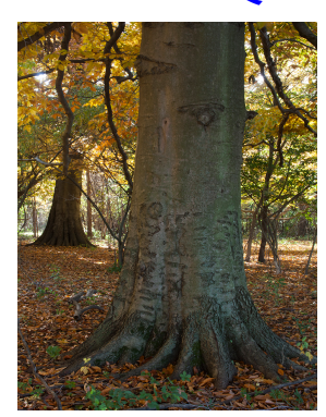
Beech Trees in Woodrum Woods

Sometimes, you realize you have to go no farther than your own back yard to take some good photos. Last weekend, I headed out into my own 5-acre back yard and came back with some excellent images.