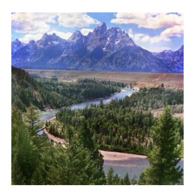
Snake River and the Tetons