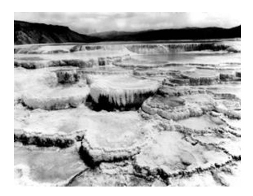
Mammoth Hot Springs

The trip will be limited to 10 participants, so sign up soon to reserve your spot. There will be an informational meeting where you can get all the details on this trip. During this meeting, Les will show you the sites you will see during the trip. Also, equipment needed, and all the details for the trip will be discussed. This informational meeting will be held February 3, 2014 at the DACC Village Mall office starting at 6:00 p.m.