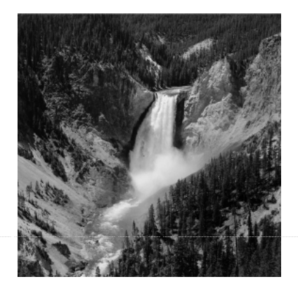
Lower Falls, Grand Canyon of the Yellowstone